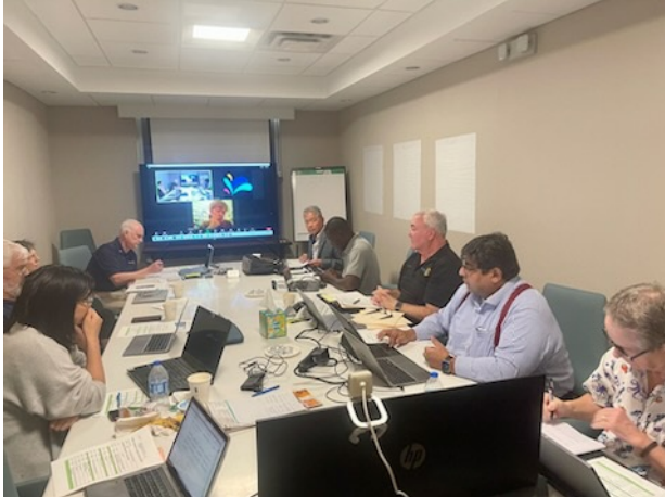
The WASH-RAG Operations Team in Orlando, Florida, USA.